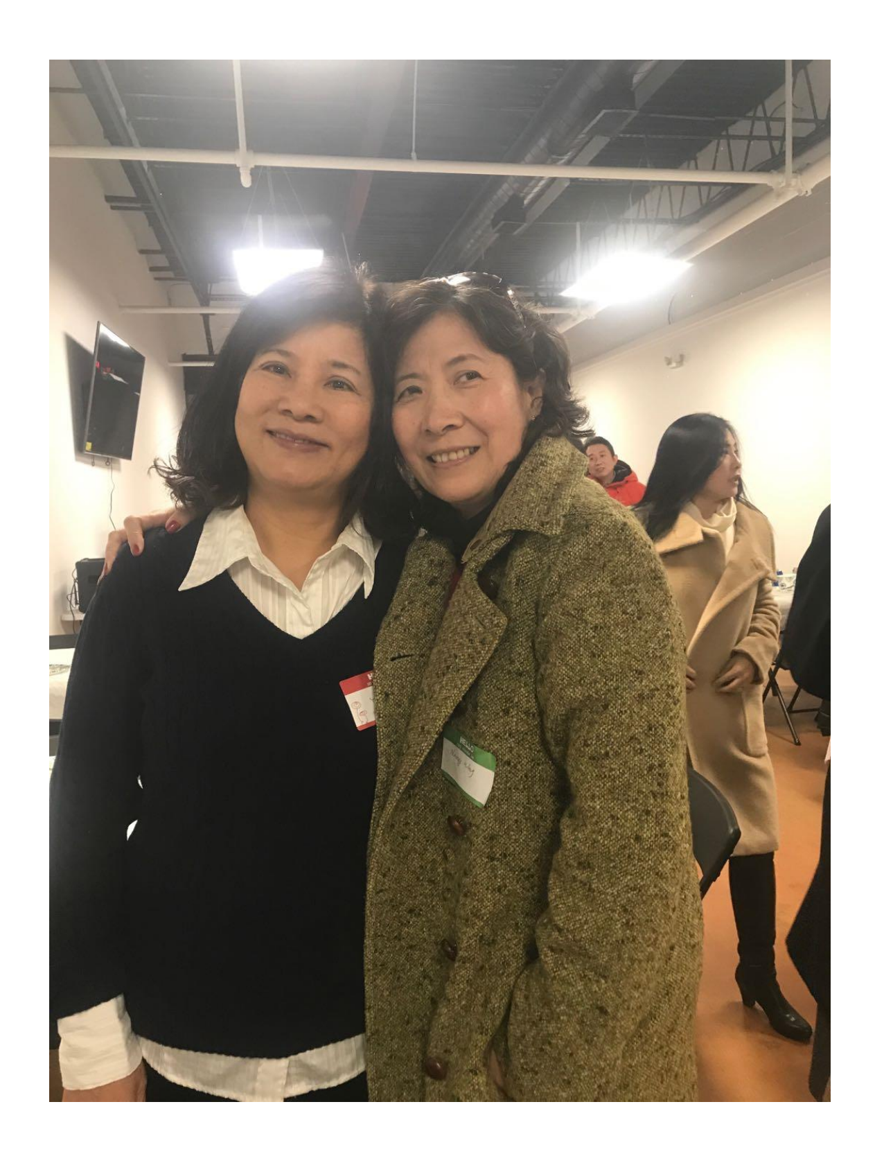
Memory 3: Outstanding agent awards