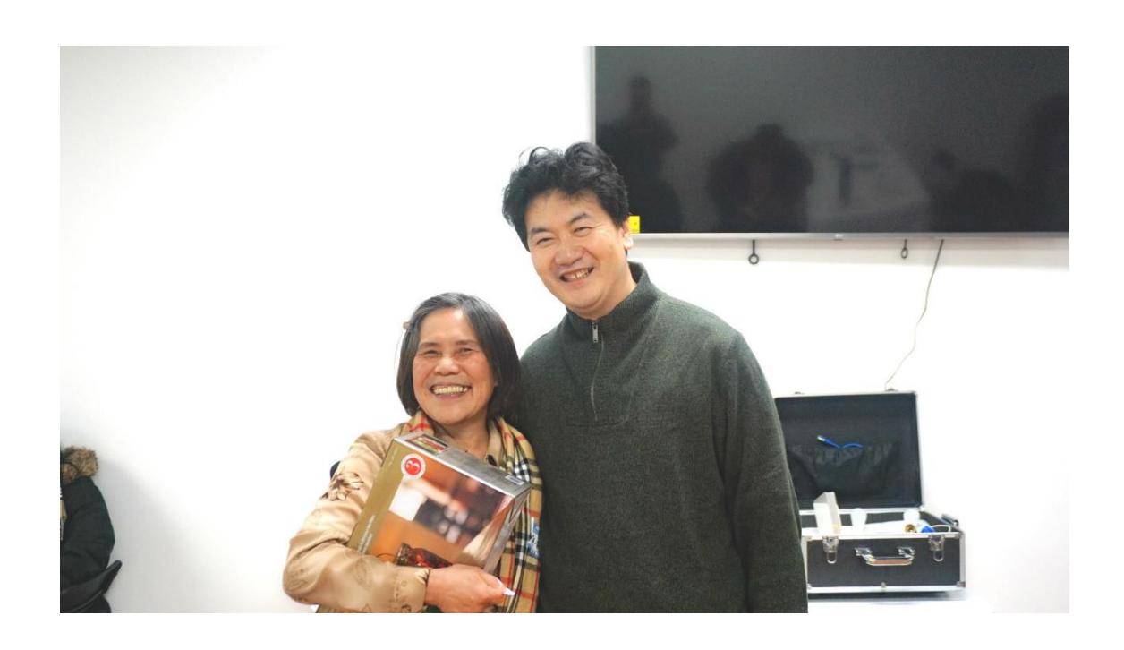
Me mory 5: Lucky draw winners