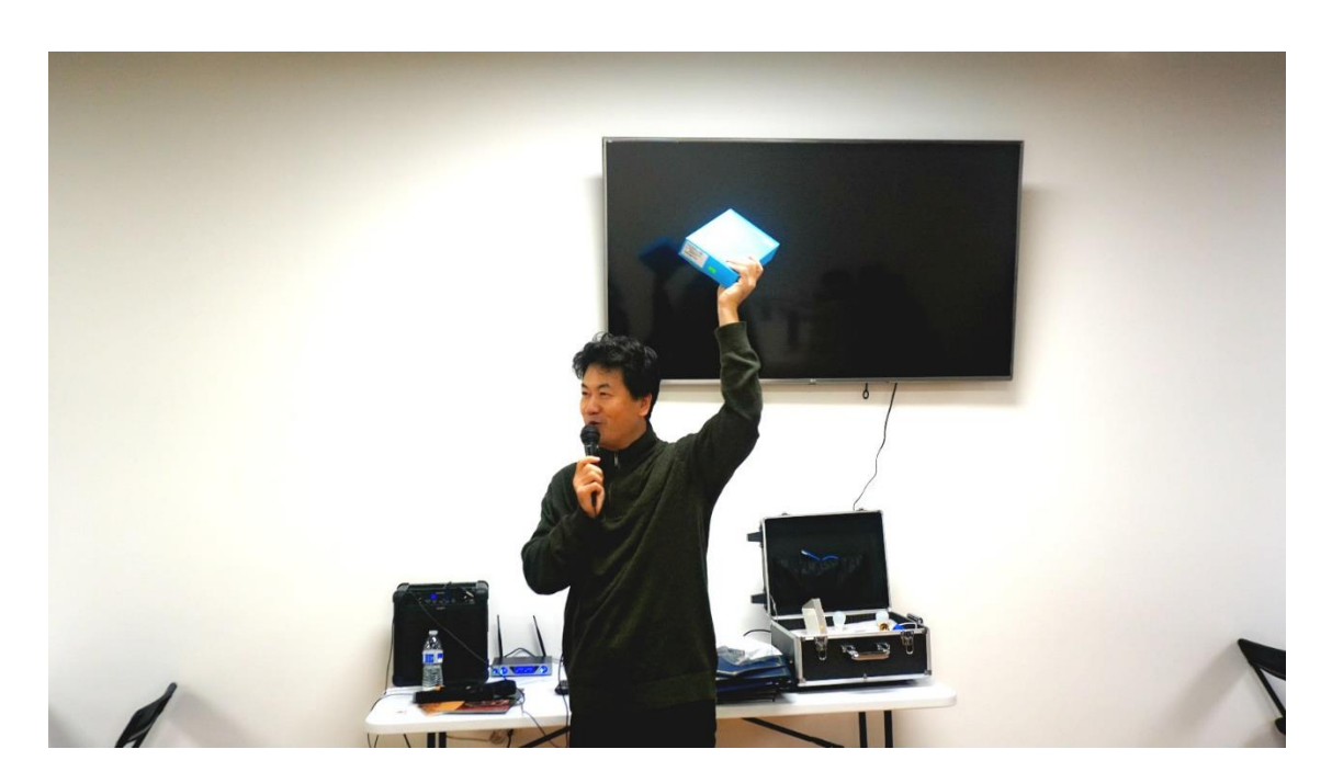
Top prize: A smart tablet, wow!