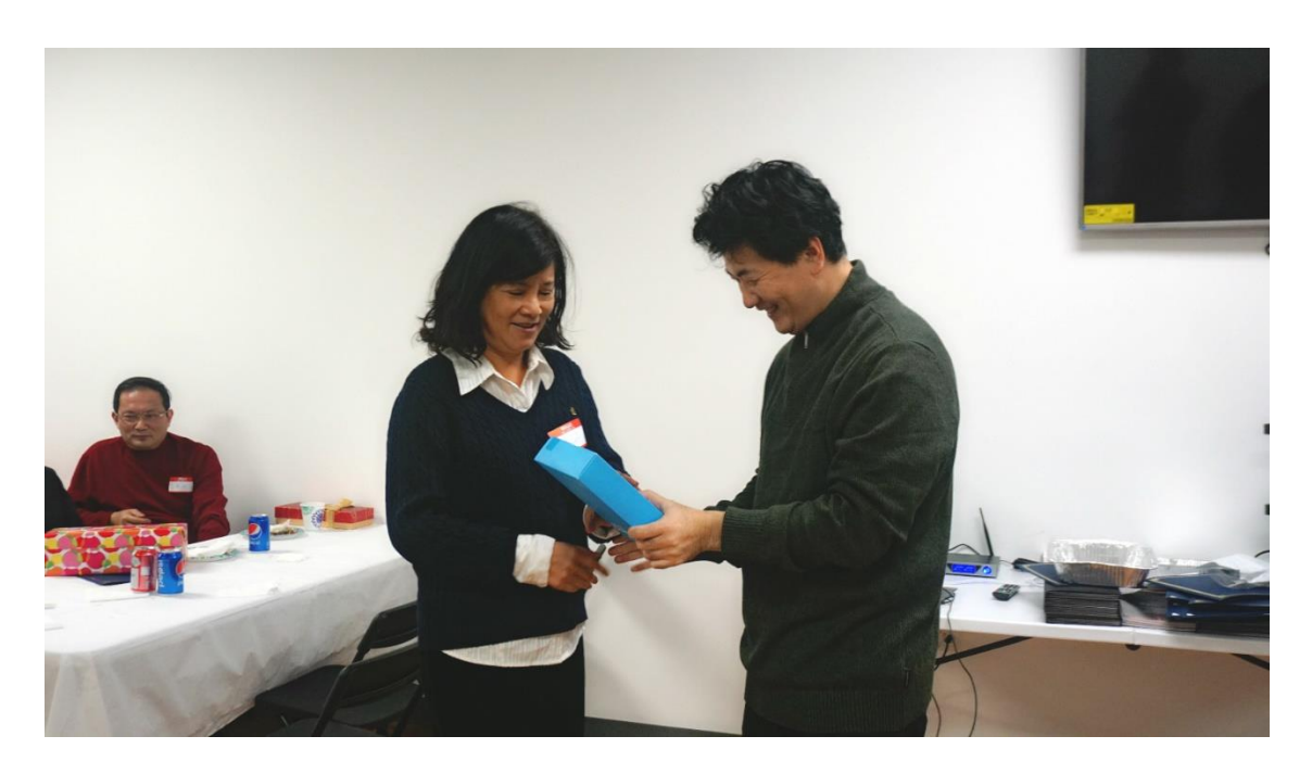
And the winner!