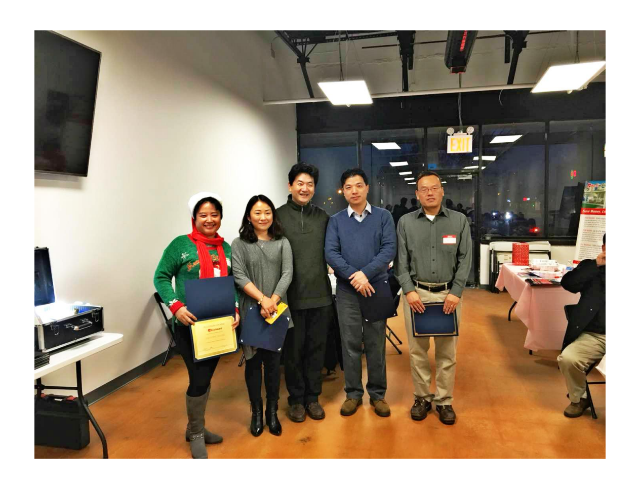
Me mory 4: Gift exchange program