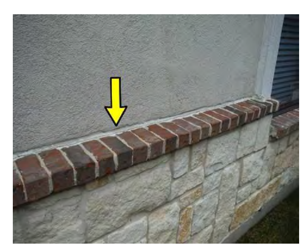
Reseal along top of brick corbeling as required.