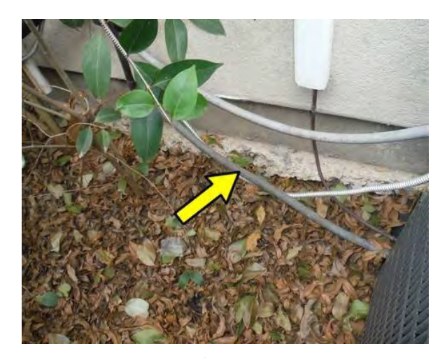
Insulation missing on refrigerant line.