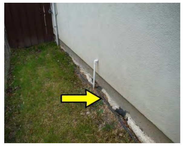
Foundation beam exposed on west side.

Splashblocks/diverters are needed at end of some downspouts to improve water flow.