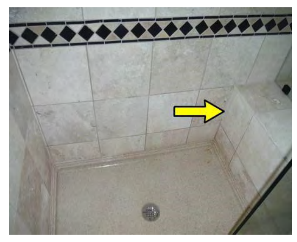
Reseal around base and corners as required in the master shower.