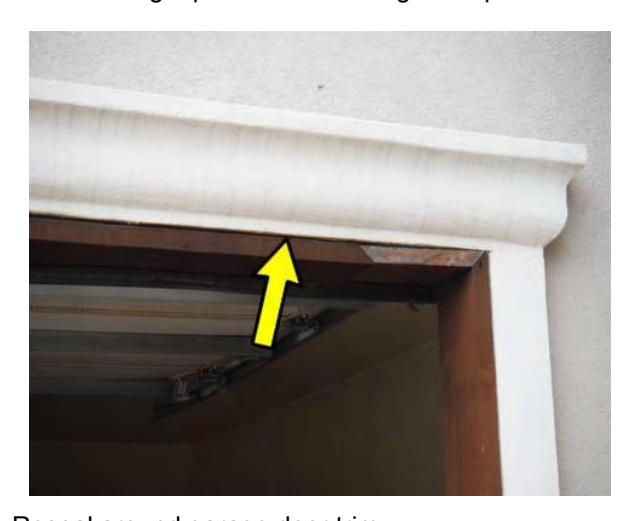
Reseal around garage door trim.