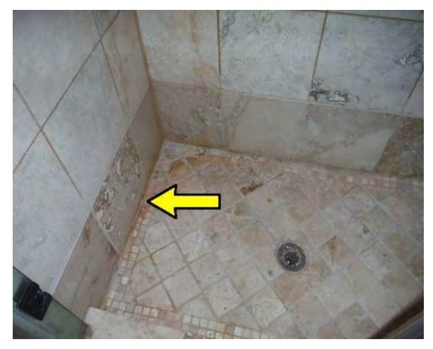
Reseal around base and corners of downstairs shower as required.

The structure behind the tile surrounds in showers and tubs is not visible on a TREC inspection. When joints need caulking this may only be sealing up a potential hidden issue, i.e., missing waterproofing, leaking shower pan, etc. If any concerns exist, a licensed contractor and/or plumber should be consulted.