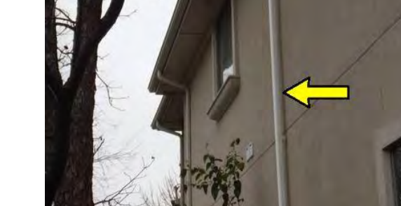
Downspout leader missing on west downspout.