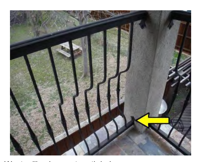
Missing fasteners at the balcony railing feet.