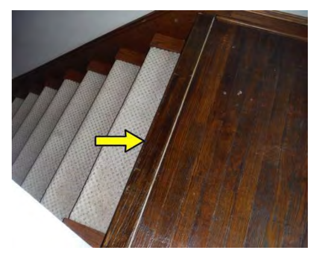
Wood buckling in family room.