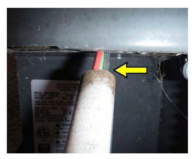
Conduit loose at south ac unit.