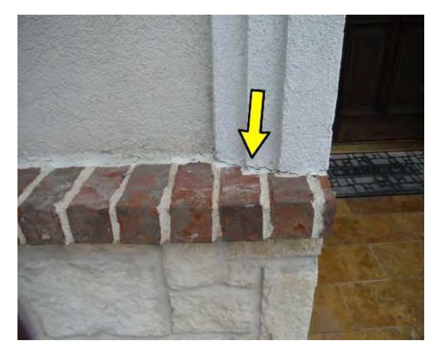
Reseal along top of brick corbeling as required.