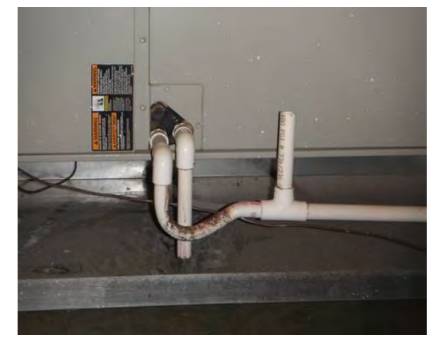
Example of correct installation of p-trap and vent on main condensate drain line.