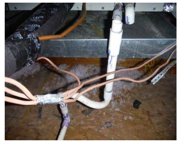
Vent is installed on incorrect side of p-trap on north unit. Cap existing vent and install new vent.